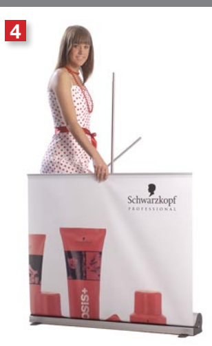
Pull the banner halfway out of the cassette.