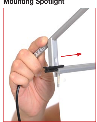
Slide the spotlight along the top rail groove.