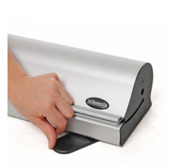
For increased stability pull out the four support legs on the cassette.