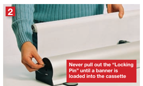
Hold the banner and remove the locking pin.