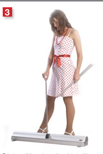
Take two of the pole sections (start with the untapered) and mount these on the