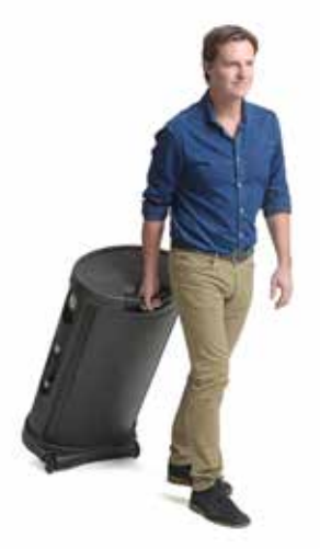
This hard case can be used in combination with wooden table top (IS-5067)